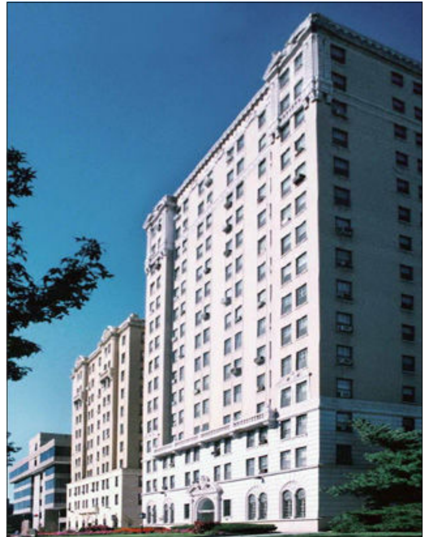
The President Apartments and Park Royal Apartments. Bianco acquired these classic St. Louis apartment towers in 1973 and 1995.

We have worked hard to build a reputation in the real estate community as knowledgeable investors who perform promptly and buy quality properties.